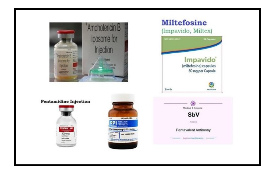
Fig.3: Drugs used for the treatment of Leishmaniasis

toxicity of these two on kidneys and ears has reduced the acceptance(van Griensven and Diro, 2012).